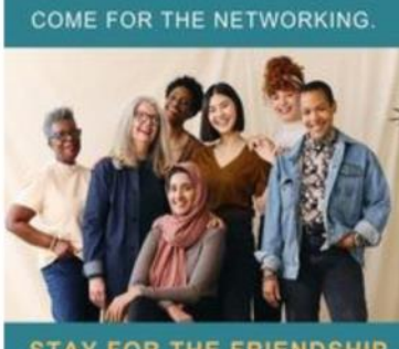
STAY FOR THE FRIENDSHIP.

The Trendsetter Chapter of the American Business Women's Association ("ABWA") is open to all who are looking for a place to meet and network. We meet the 3rd Tuesday of Every Month